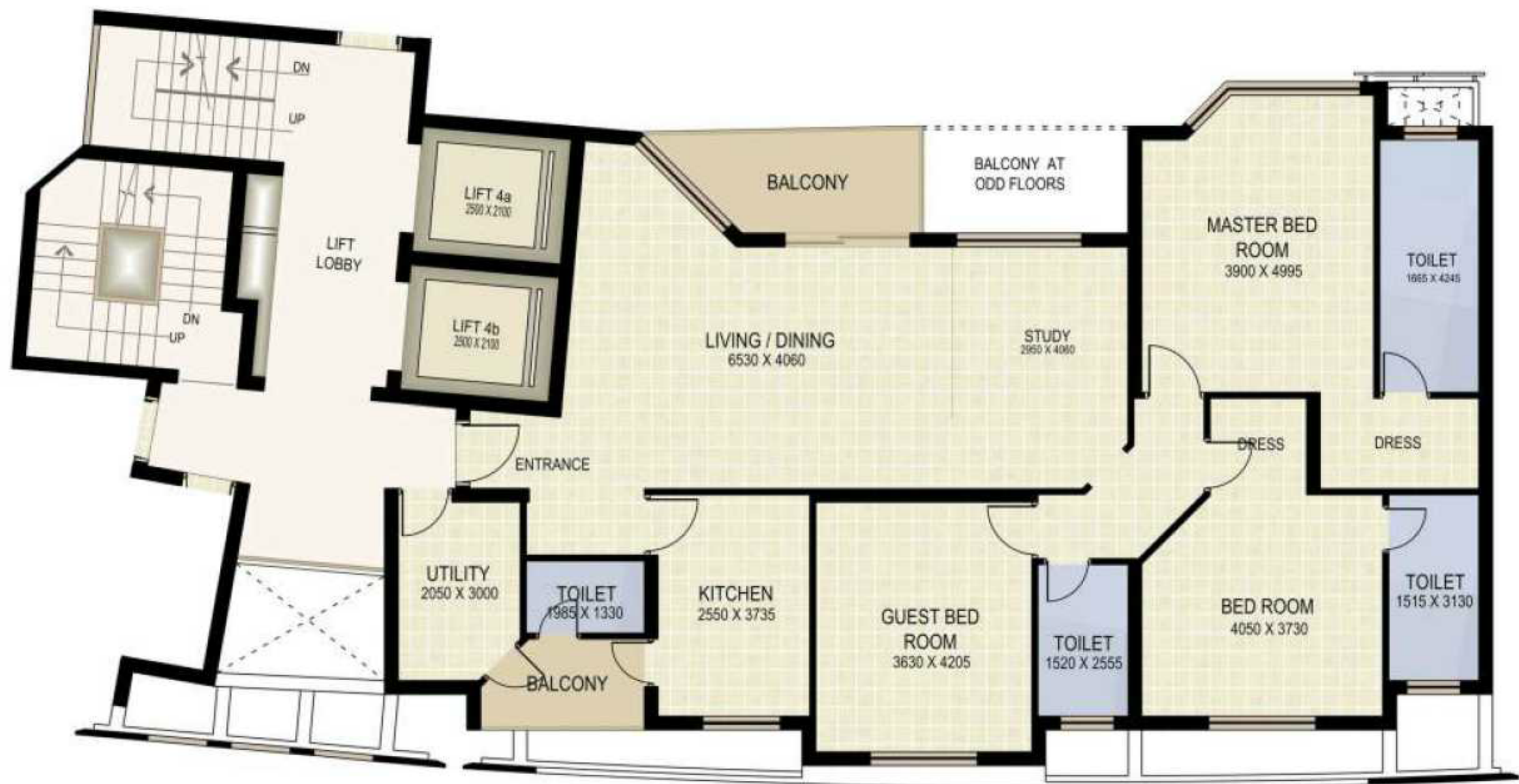
Typical 3 Bedroom + Study Unit + Worker Room