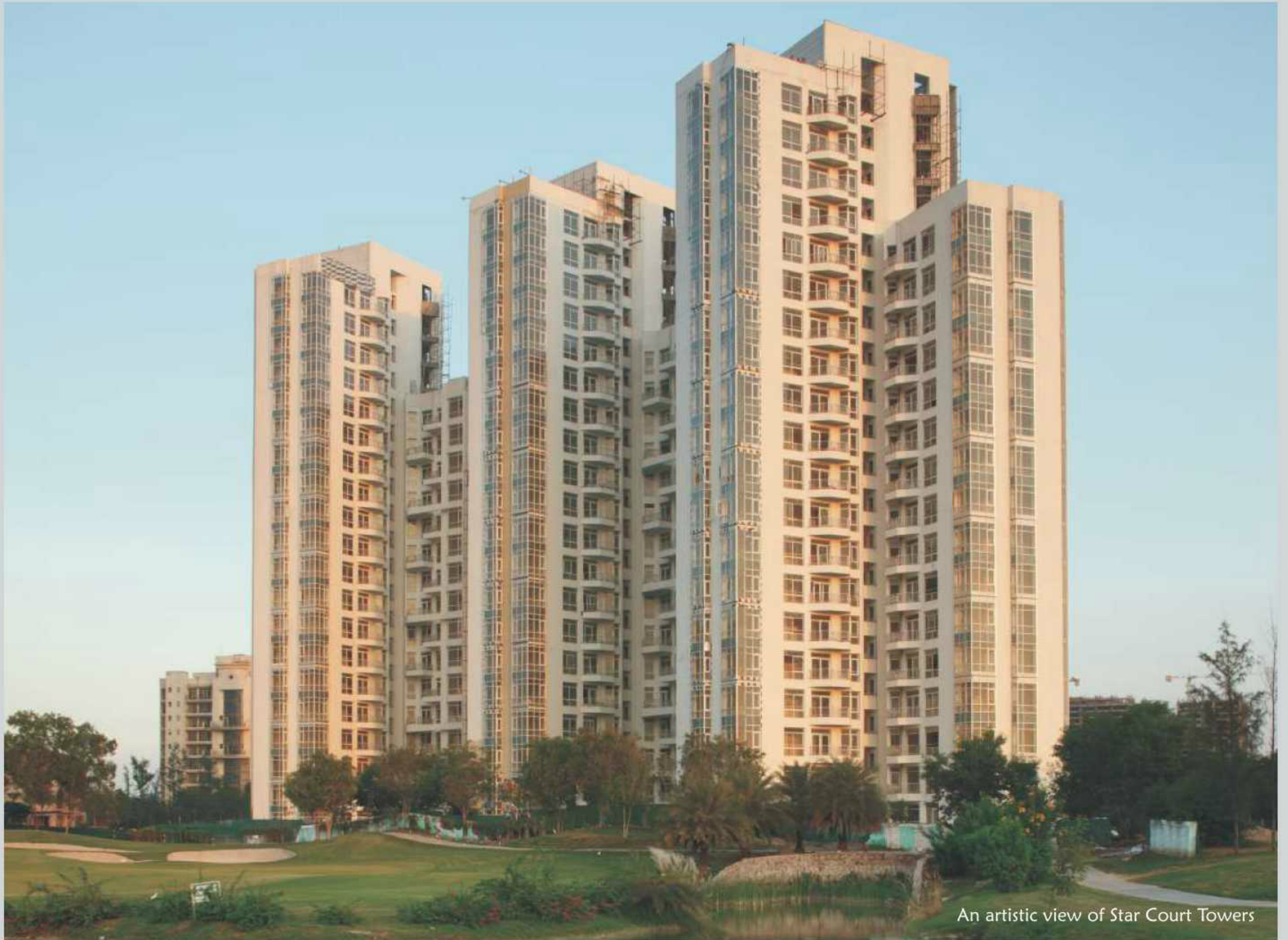
An artistic view of Star Court Towers