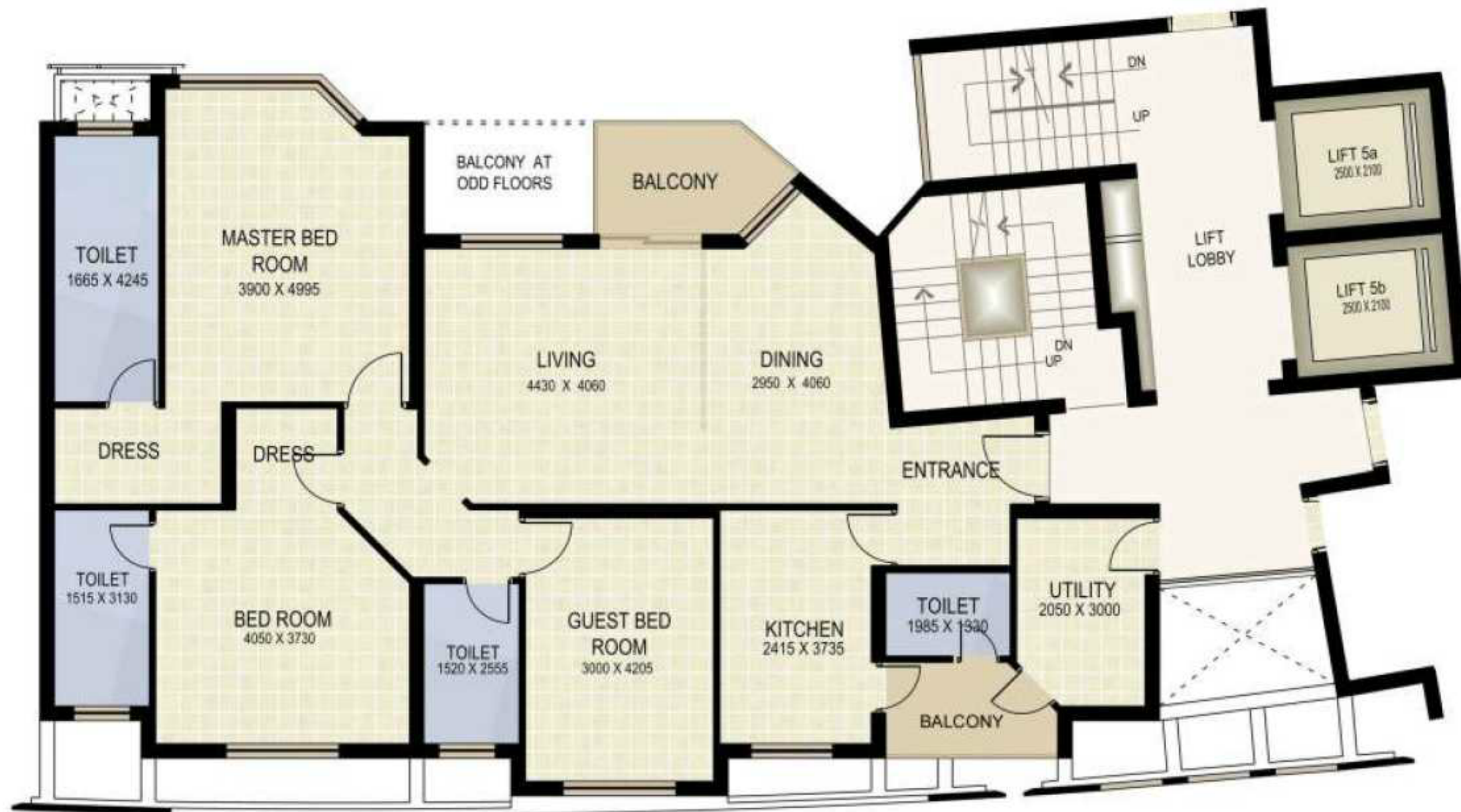
Typical 3 Bedroom + Worker Room