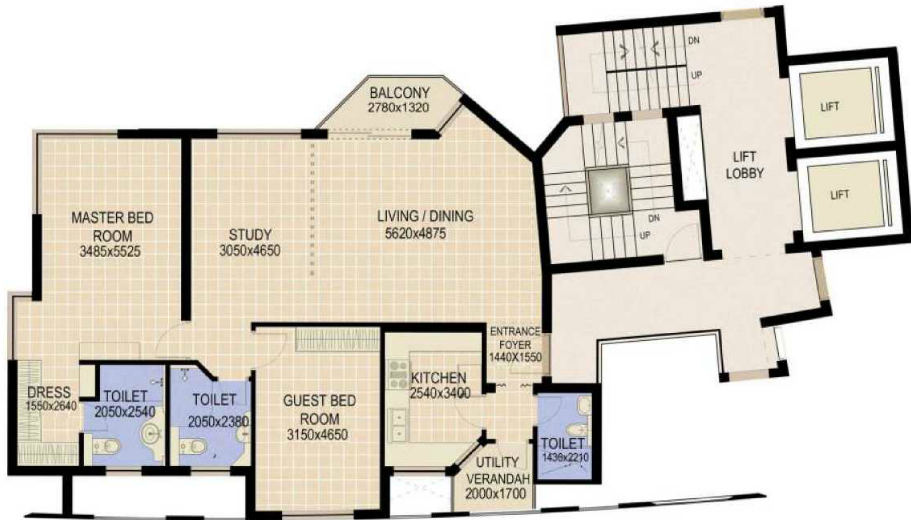
Typical 2 Bedroom + Study Unit