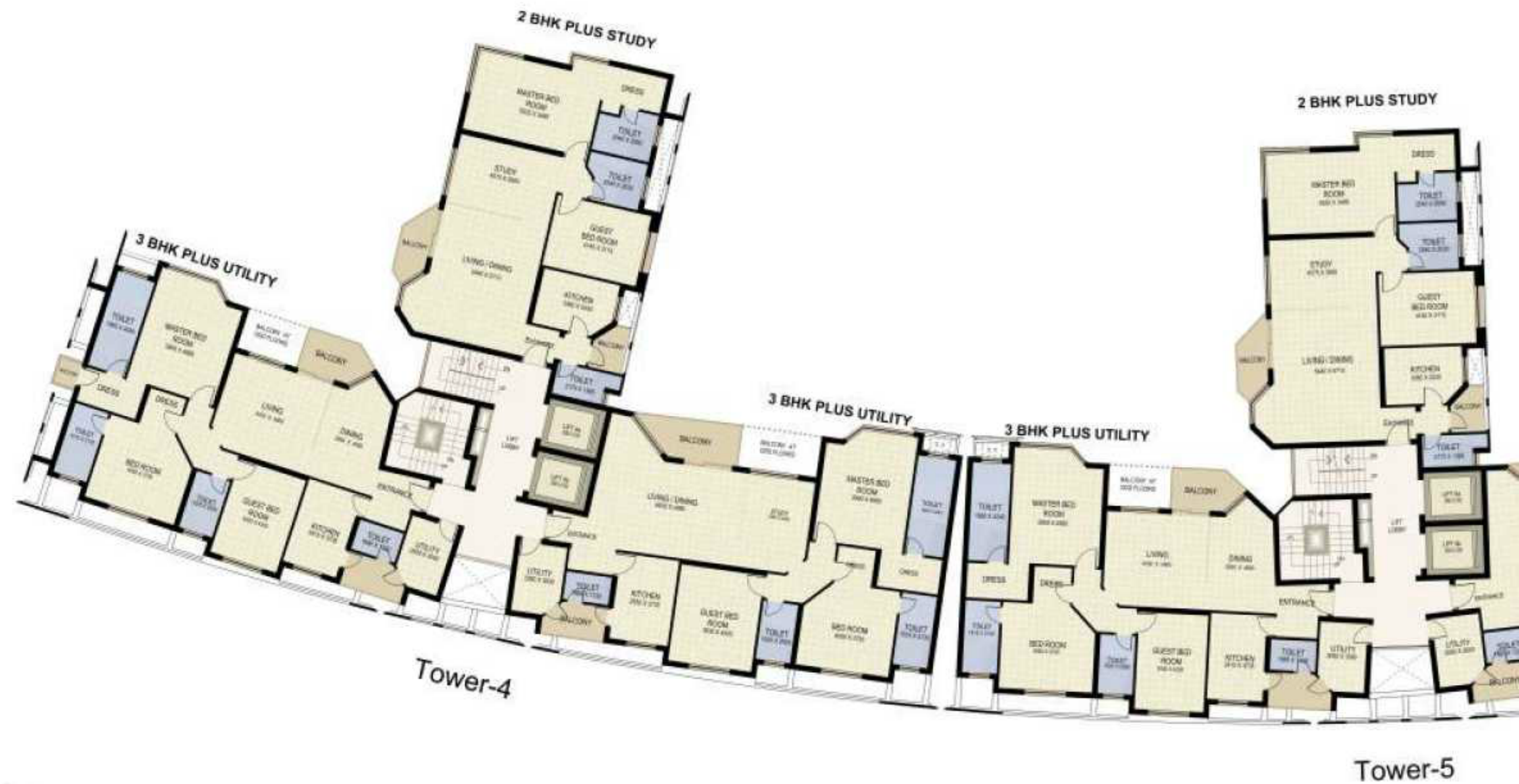
Typical Floor Plans - Towers 4, 5 & 6