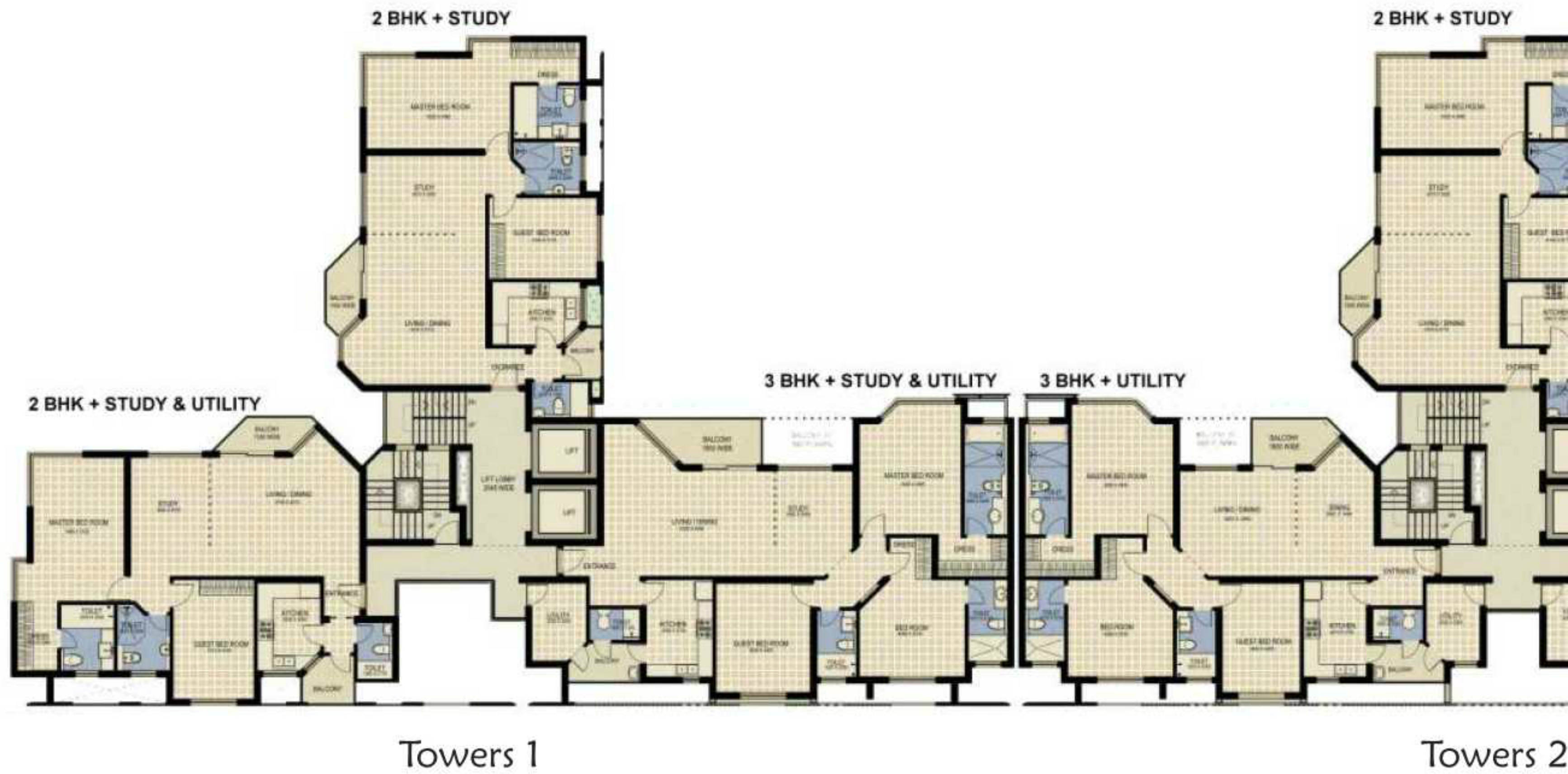
Typical Floor Plans - Towers 1, 2 & 3