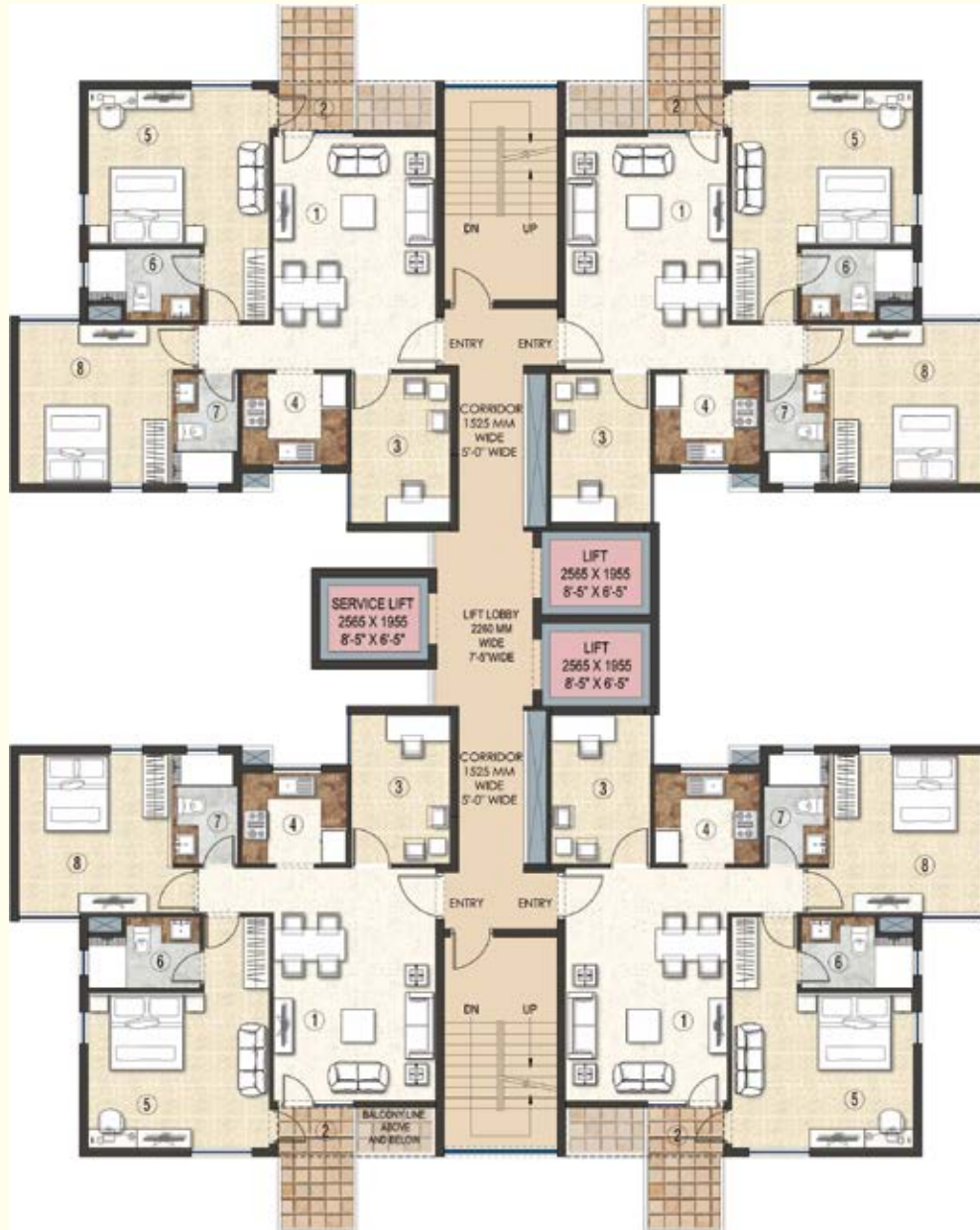
BLOCK- L TYPICAL CLUSTER PLAN TYPE - 2BHK + S

SALE AREA : 114.27 sq. mt. (1230 sq. ft. approx)