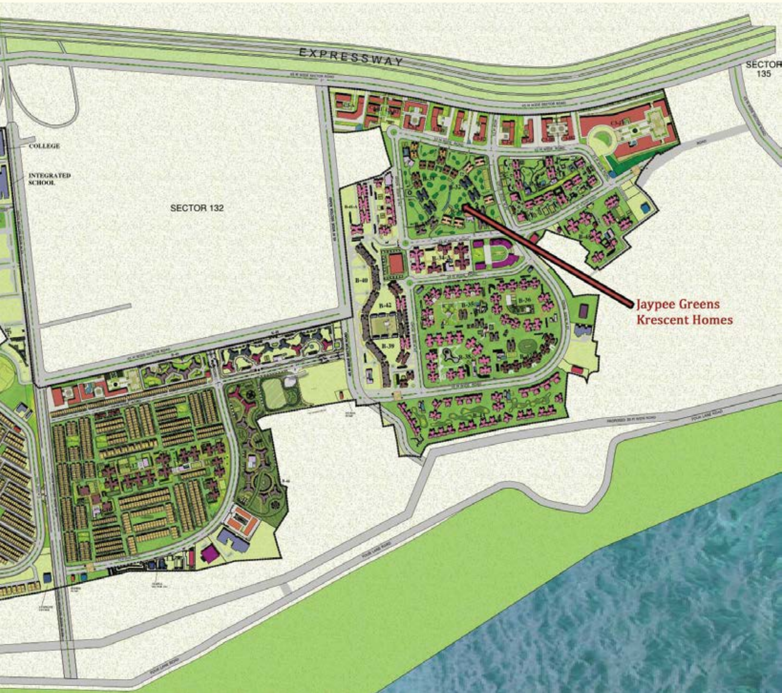
MASTER PLAN (JAYPEE GREENS THE KRESCENT HOMES)