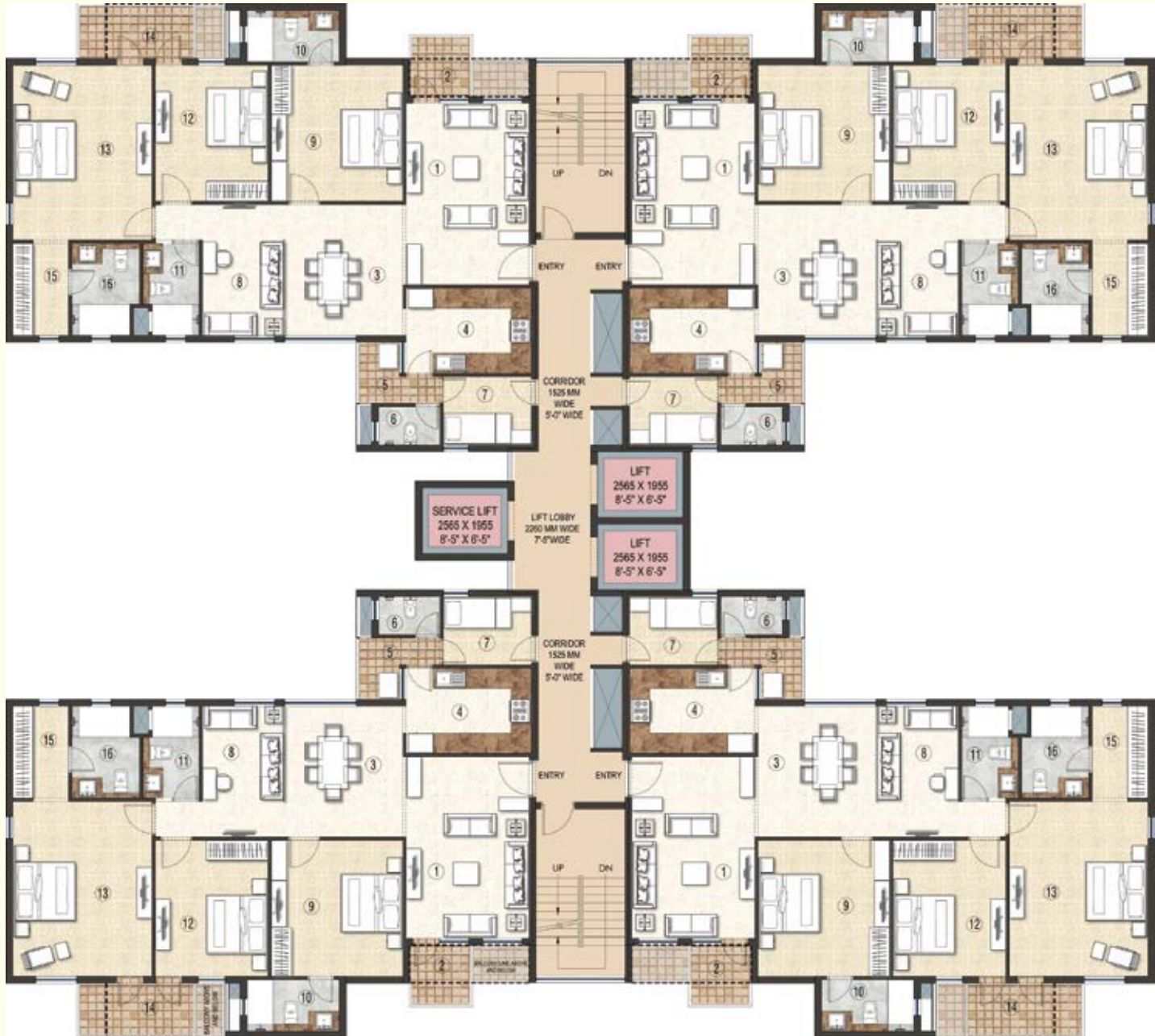
BLOCK- N TYPICAL CLUSTER PLAN TYPE - 3BHK + W + S

SALE AREA : 183.94 sq. mt. (1980 sq. ft. approx)