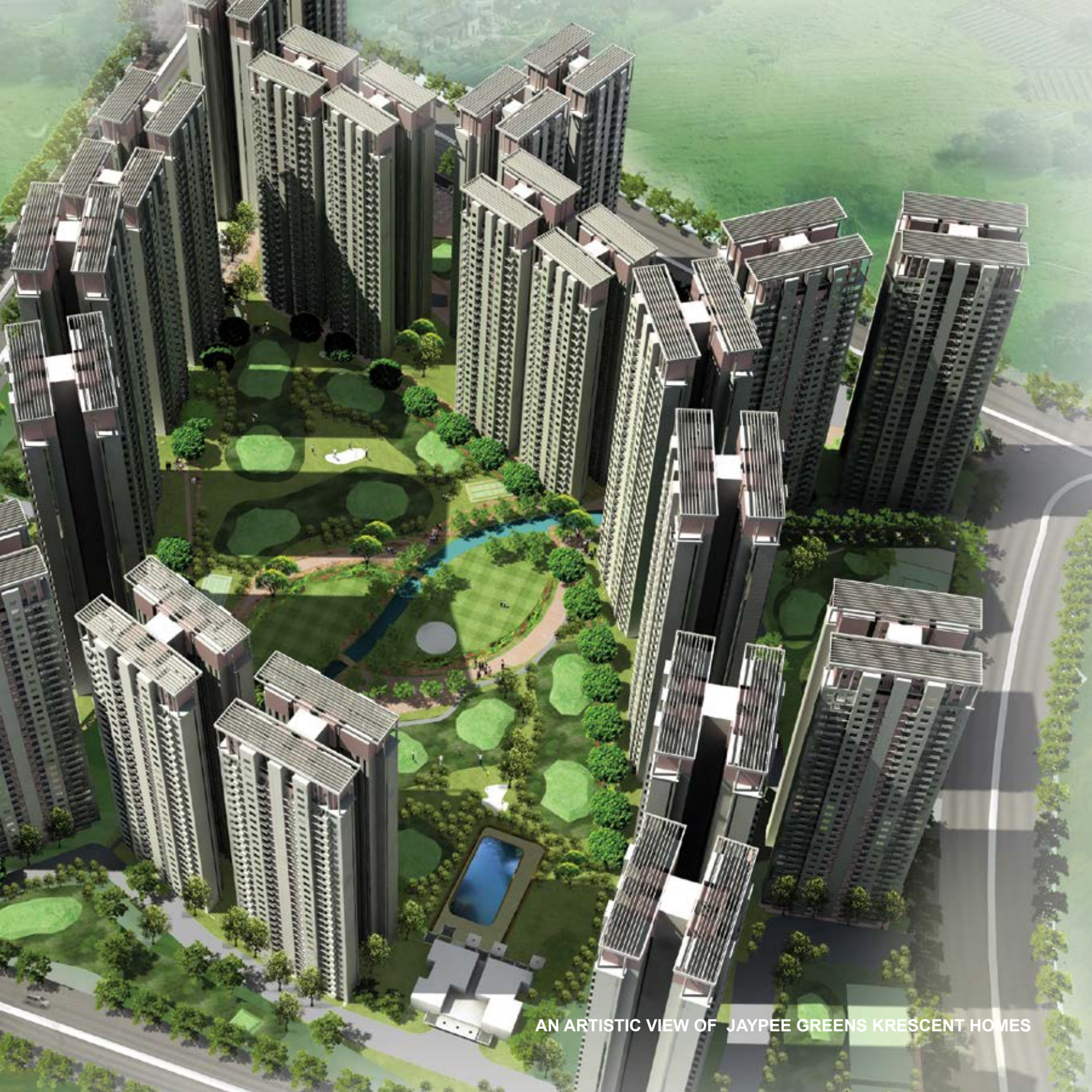
AN ARTISTIC VIEW OF JAYPEE GREENS KRESCENT HOMES