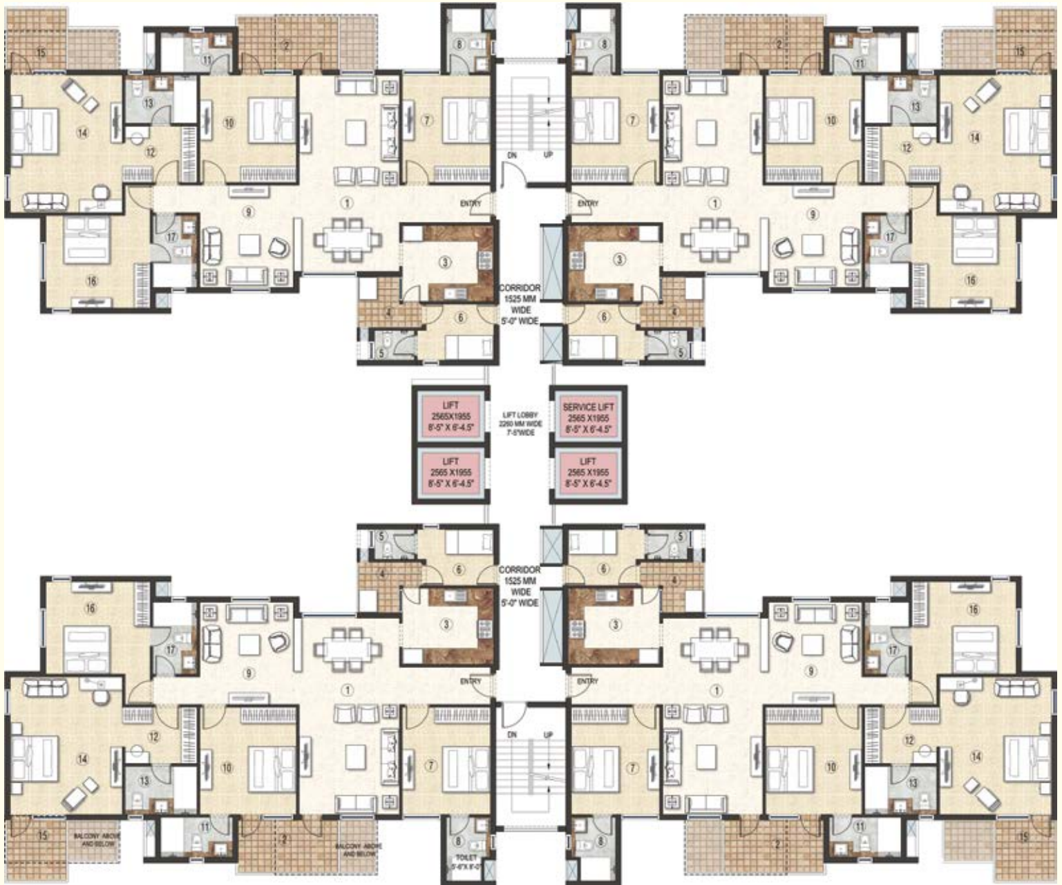
BLOCK-P TYPICAL CLUSTER PLAN TYPE - 4BHK + W

SALE AREA : 220.65 sq. mt. (2375 sq. ft. approx)