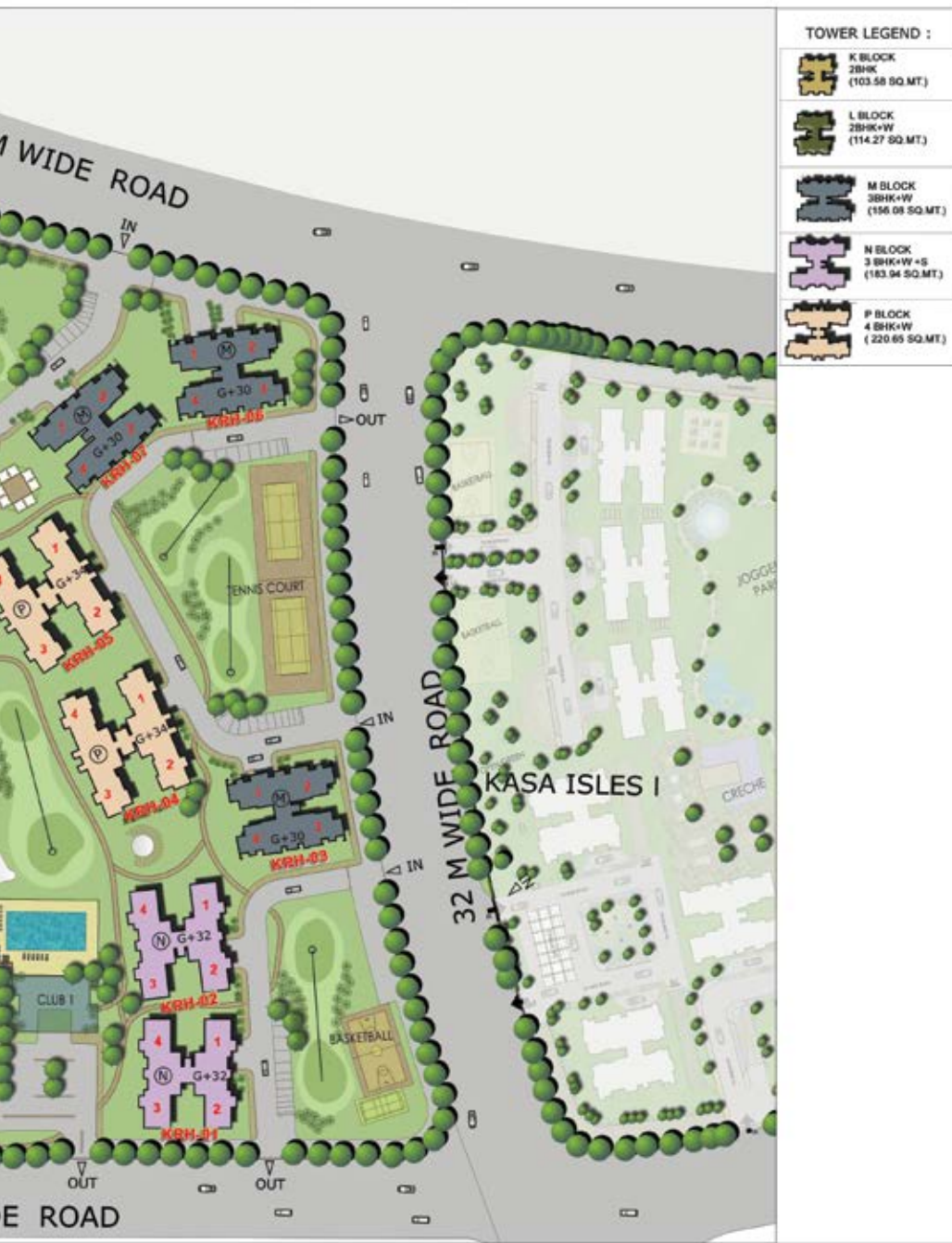
LAYOUT PLAN (JAYPEE GREENS THE KRESCENT HOMES)