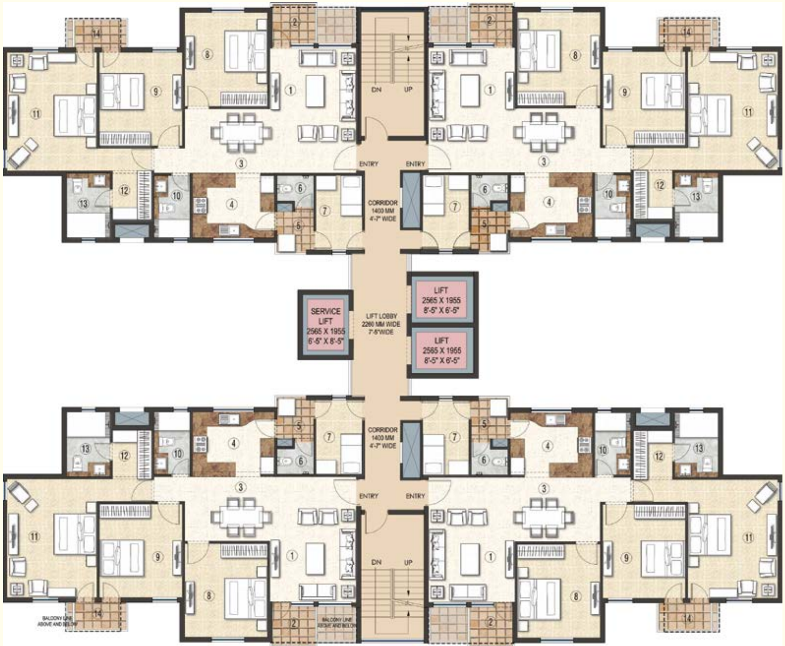
BLOCK- M TYPICAL CLUSTER PLAN TYPE - 3BHK + W

SALE AREA : 156.08 sq. mt. (1680 sq. ft. approx)